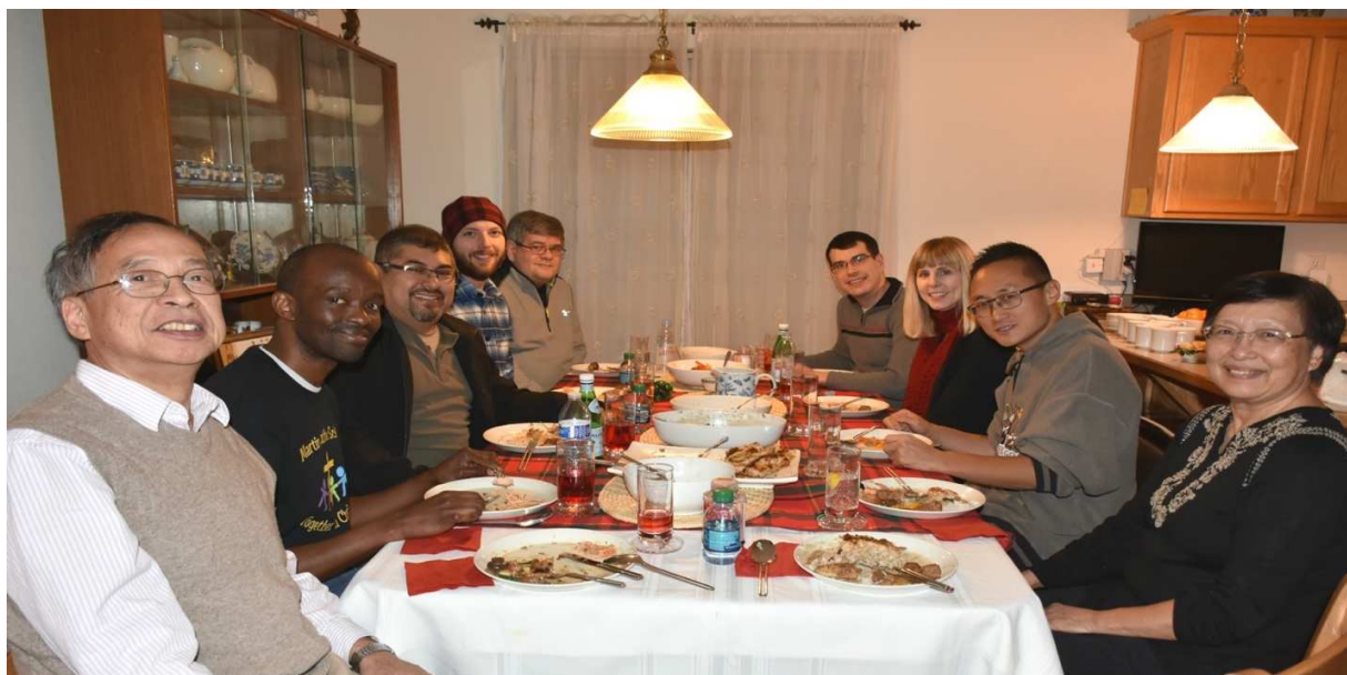
Dinner at Wan's home 2017 Western Seminary