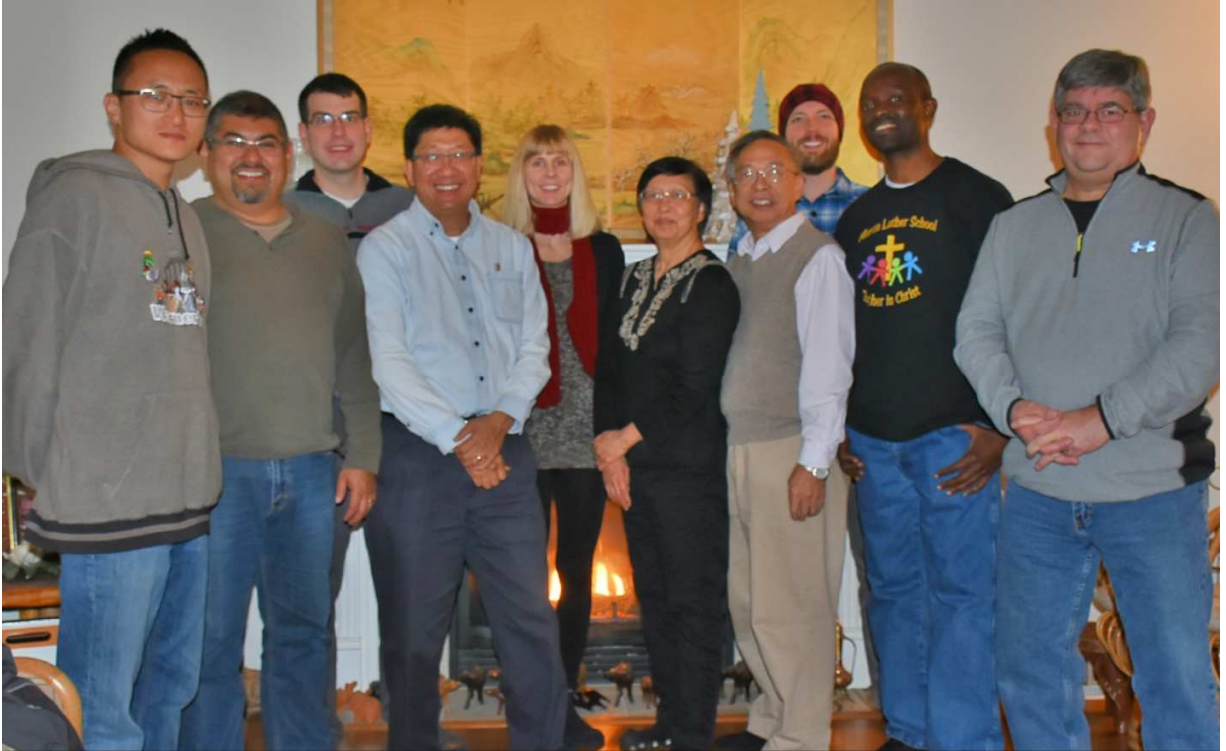
Western Seminary 2017