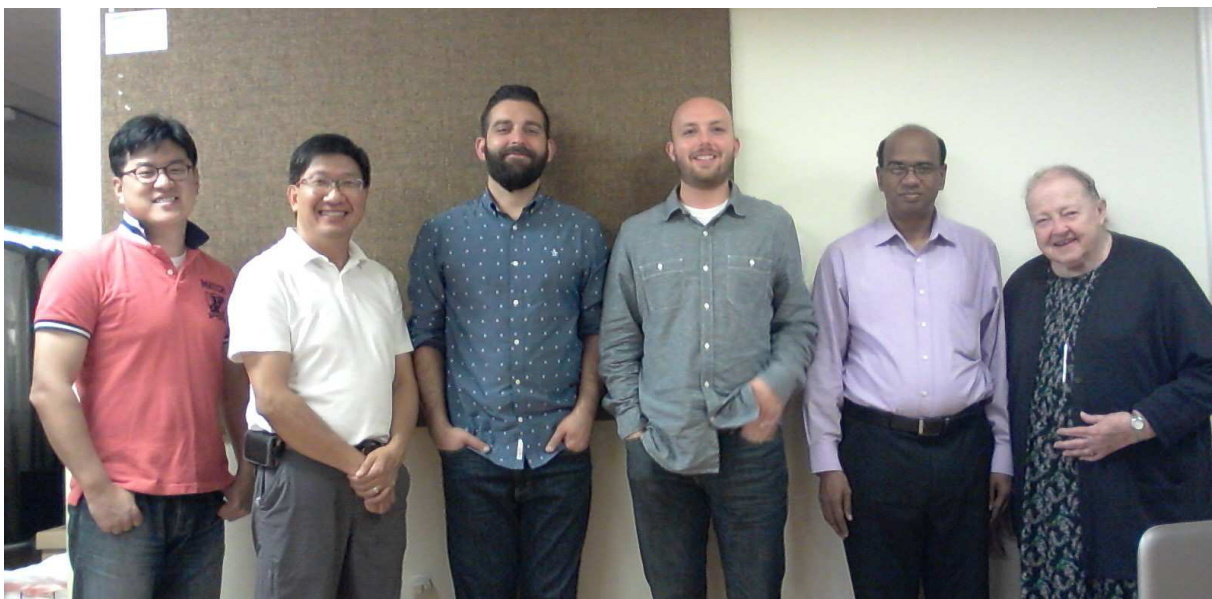
History of Missions class DIS Western Seminary 2014