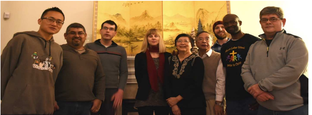
Western Seminary 2017